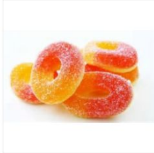
SPACE JAM GUMMY RINGS