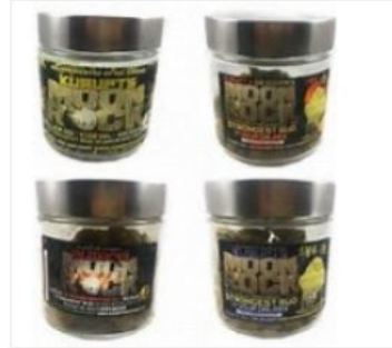
L T H PLATINUM MOON ROCKS (OG S