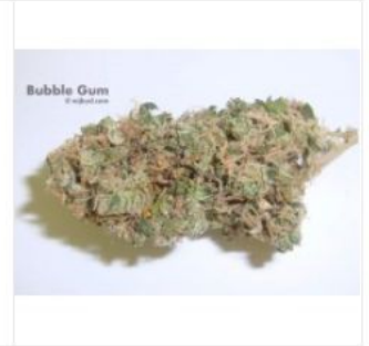
EXCLUSIVE BUBBLE GUM OG